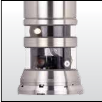
Unique pan and tilt camera movement provides superior well casing examination