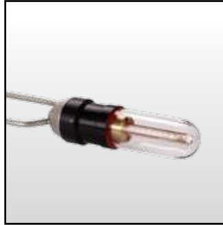
LED lighthouse, available in two lengths, for clear downhole viewing