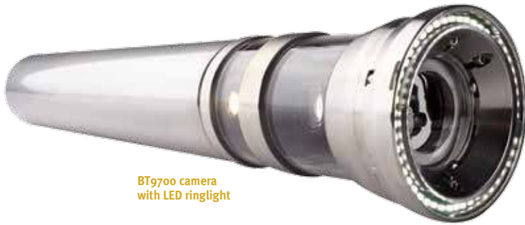
BT9700 camera with LED ringlight

The camera's single-module design allows it to tilt off-center and zoom in both views. This unique operating benefit produces clear, quality images to more accurately evaluate difficult conditions.