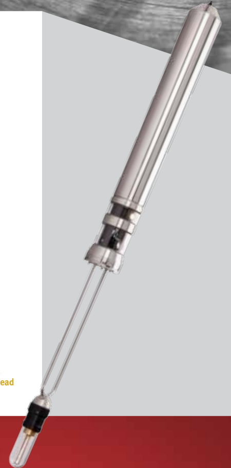
BT9700 camera with LED lighthead